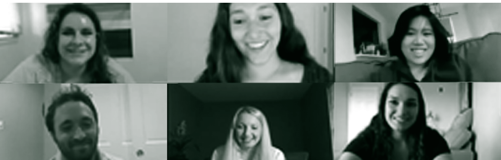
Images from the Educational Program on Zoom

It has also been presented to groups at Lake Forest College, Lake County States Attorney’s Office, Rosalind Franklin University, Tri-Delta Sorority, College of Lake County, and is poised to reach students across the fourteen-college-strong Associated Colleges of the Midwest, national Tri-Delta chapters, and well beyond.